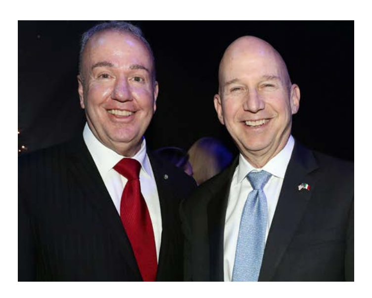
has established with other Italian American organizations to collectively advocate for the Italian heritage in the United States?

Collaboration among Italian American organizations can be crucial in amplifying the voice of the community. Can you tell us about any joint initiatives or partnerships that NIAF