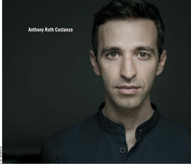
Anthony Roth Costanzo