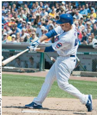
Ben Grey (CC BY-SA 2.0)

collecting seven medals – three bronze and four silver. In the 2006 Olympics, she took home a gold medal. Mancuso continues to train and compete as a member of the United States Ski Team.