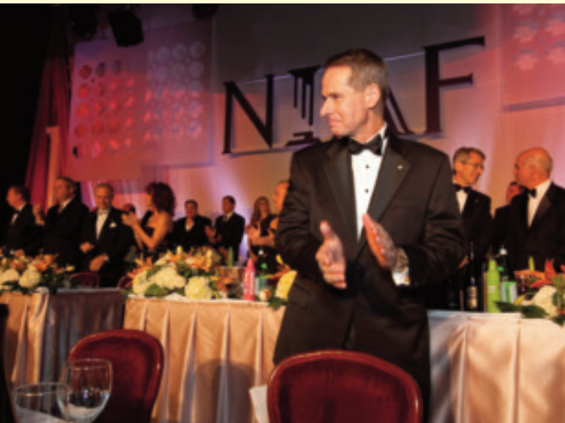
Former Chairman of the Joint Chiefs of Staff Gen. Peter Pace, a new member of the NIAF board, attends the Foundation's 34th Anniversary Gala.