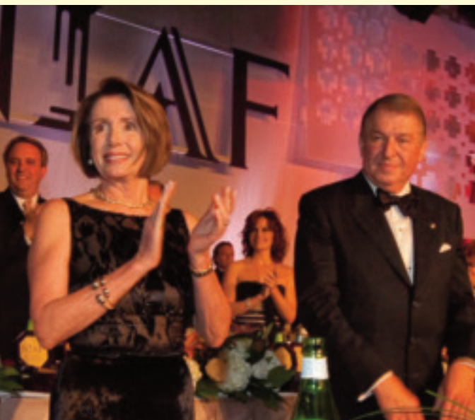
Speaker of the House Nancy Pelosi and NIAF Chairman Jerry Colangelo