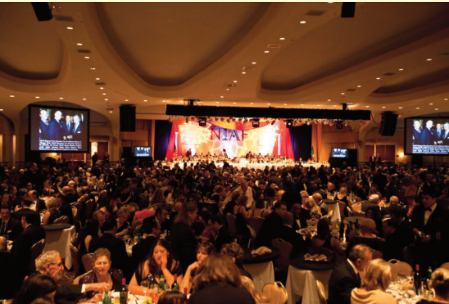
Guests packed NIAF's 34th Anniversary Gala, held at the International Ballroom of The Hilton Washington.