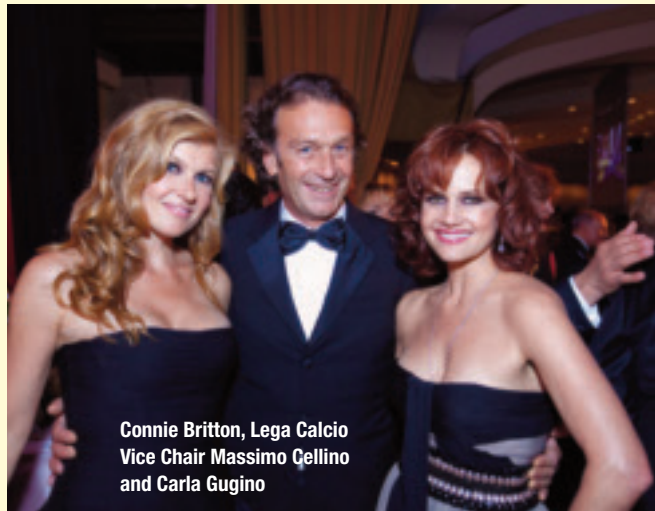
Connie Britton, Lega Calcio Vice Chair Massimo Cellino and Carla Gugino