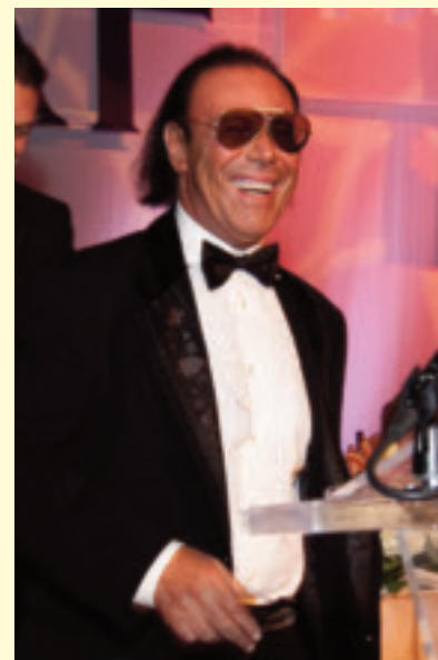
2009 NIAF Honoree Antonello Venditti