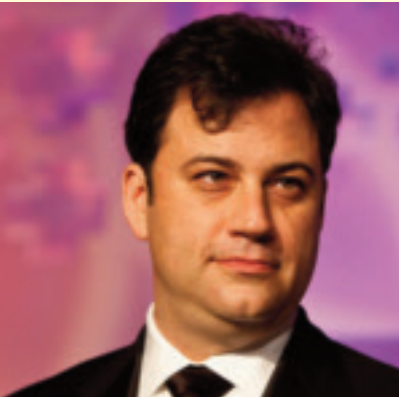
Master of Ceremonies Jimmy Kimmel