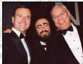
Franco Frattini, Luciano Pavarotti and Colin Powell