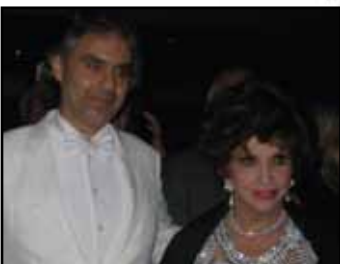
Andrea Bocelli and Gina Lollobrigida