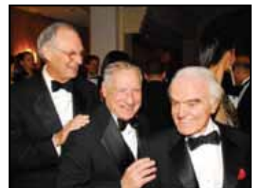
Alan Alda, Mel Brooks and Jack Valenti

Gala dinner tickets come with select packages! See page 4 for details.