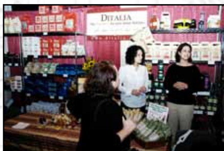
Guests examine Italian gourmet food specialties on display by online marketplace D'Italia.