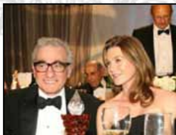
Martin Scorsese and Ellen Pompeo