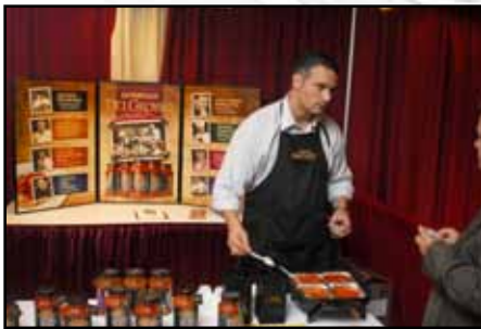
A selection of LaFamiglia Del Grosso pasta sauces were available for tasting.

At last year's Piazza d'Italia, guests had the opportunity to sample fresh, hand-made mozzarella cheese, a wide variety of wines, authentic gelato, espresso coffee, salami, cheese, pasta and sauces, olive oil, and hors d'oeuvres. Also featured were informational booths about Italian language, education, fashion, humanitarian efforts, social networks, political groups, and travel agencies