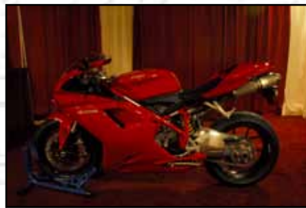
Luxury vehicles like the above Ducati motorcycle were on display.