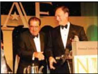
U.S. Supreme Court Justices Antonin Scalia and Samuel A. Alito, Jr.