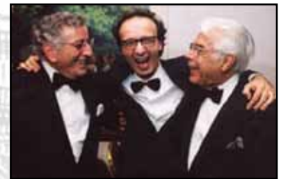
Tony Bennett, Roberto Benigni and Jerry Vale