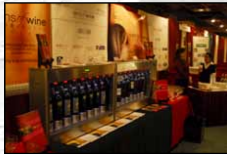
Piazza guests were able to sample some fine Italian wines from Luca Maroni.