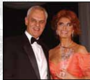
Former President of the Italian Senate Marcello Pera and Sophia Loren