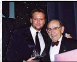
Tim McGraw and Yogi Berra